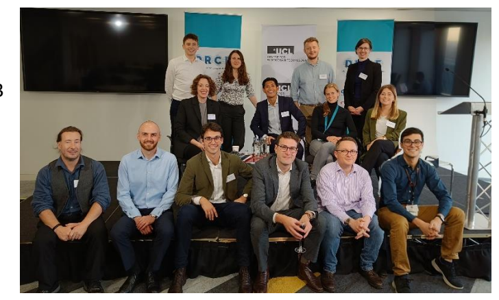
Figure 2: DRCF horizon scanning team at Web3 Symposium